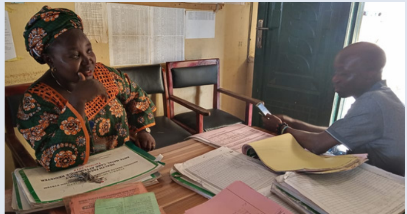
Staff of EHAi interacting with the OIC at one of the PHCs in Irewole LGA in Osun State during the conduct of the routine Monitoring and Supportive supervision visits