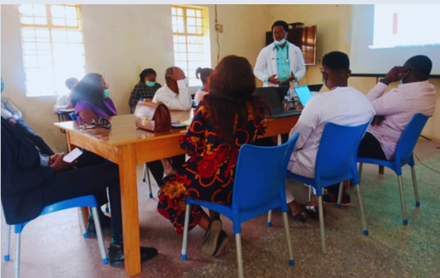
Switch committee and program review meeting with HCW at OLAH Akwanga