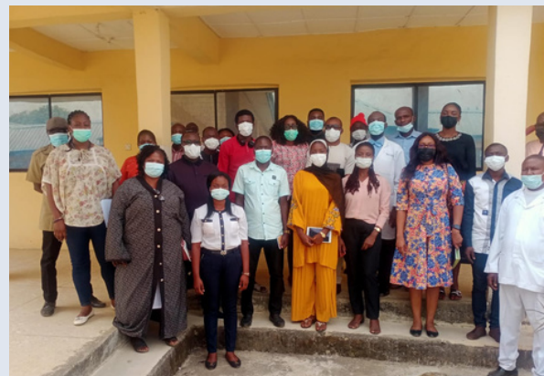
Supportive supervision visit from CDC to GH Wamba