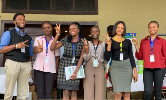
EHAi interns attending the 2023 CAREER AND ENTREPRENEURIAL FAIR organized by CIPM NIGERIA.