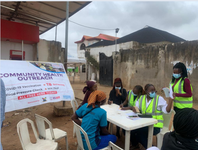
TB LON 3 Outreach at Mushin LGA, Lagos